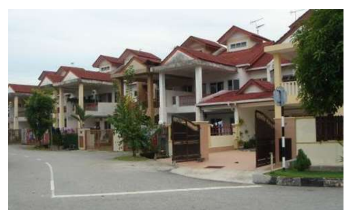
Figure 1: Contemporary terraced houses

Terraced house designs were introduced in Malaysia (then Malaya) around the beginning of the twentieth century during the early years of British colonial rule. Based on the British terraced home designs, the houses usually have only two elevations: the front and back. The living quarters and the main bedroom are located at the front of the house, and the kitchen and other bedrooms are at the back. Mass contemporary and intrinsic terraced houses have been built since the late 1960's, but the design of the buildings has not evolved much since its predecessor (Figure 1).