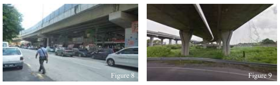
Figure 8&9: Spaces under MEX are currently being used as a space for commerce in Parcel 1 (Figure 8) and informal vegetated space in Parcel 2 (Figure 9)

There were two parcels which was studied underneath MEX. The first parcel (Tun Razak – Jalan Peel) which has a total area of 54,850 m<sup>2</sup> was still in use for commerce (see Figure 8), while the second parcel (Salak Selatan – Kuchai Lama) which has a total area of 314,843 m<sup>2</sup> was covered by informal vegetated space (see Figure 9). The spaces studied were surrounded by residential and industrial areas. Some parts of the space still remained empty and vague. The manifestation of human activity that involved in and out movement of the space was mainly due to the ease of access into the area, particularly in the first parcel. In contrast, the second space of MEX was left unused because the accessibility and continuity of human-scaled movement were obstructed by physical barriers. This was because this area is surrounded by a major highway and fences in some parts.