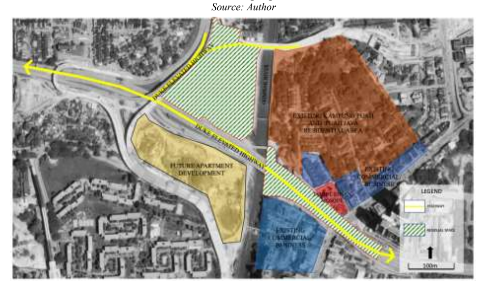
Figure 4: The residual space underneath DUKE is easily accessible from the surrounding existing and future residential area