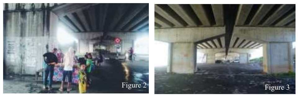
Figures 2&3: The spaces underneath DUKE being utilised informally as a place to sell food and dumping debris