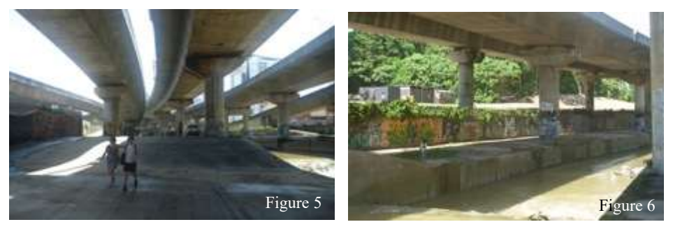
Figure 5&6: Activities observed underneath AKLEH, using the concrete bank as passage ways and fishing for aquatic life in the Klang River

the AKLEH intensifies the juxtaposition of scale. Although much of the 110,010m<sup>2</sup> space underneath AKLEH is somewhat easily accessible, the residual spaces generally appear to be undefined in use, ownership, management, and function. These residual spaces project a sense of abandonment and lost opportunities in contrast to the highly-managed and planned roadway above it. The observed activities in the space underneath AKLEH observed were limited to people using the concrete bank of the river as passage ways (see Figure 5) and people fished for aquatic life on some parts of the riverbank (see Figure 6). No activities involving commerce were observed in the site or any activities during night time.