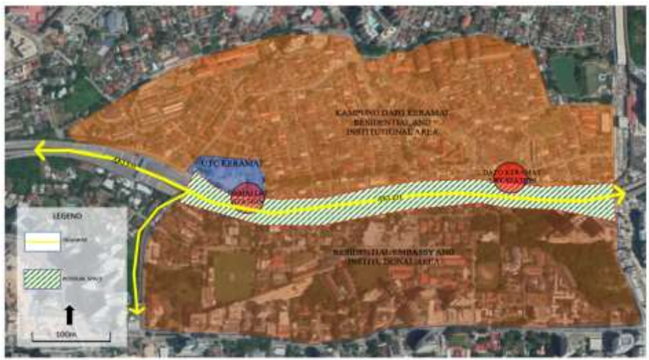
Figure 7: Residential land use surrounds the residual space underneath AKLEH