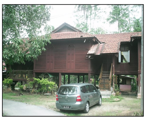
Figure 5 & 6; Traditional Malay House in Lenggong, Perak (Mohd Jaki, 2017).