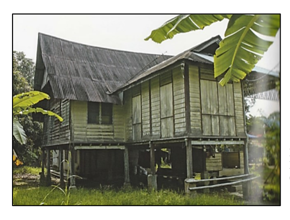
Figure 7; Traditional Malay House (Kutai House) in Perak (Sabrizaa, 2017)