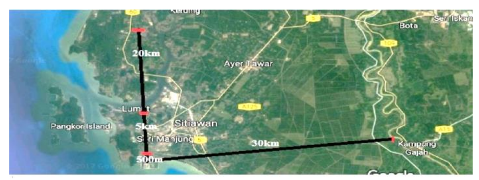
Figure 1: Map of Manjung with radius distance to Manjung Coal-fired Power Plant

background, by using the personal sampling pumps of airborne particles with cyclone and seven-hole heads was conducted. 20 contaminated samples were collected from 10 sampling points. The location of the sampling points are indicated in Figure 1.