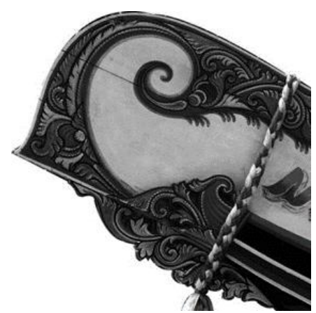
Figure 2: Kepala perahu

In this study, some forms resembling pre-Islamic images are found on the boat decoration component. Images such as the makara can be seen on the head and tail of the boat, while the engraving of the motifs can be found at each end of the bangau . This makara statue can be seen at the front of the entrance of the temple, which serves to safeguard the fishermen from evil spirits. According to myths and beliefs of Hinduism, the makara is a type of sea animal used by the God Vishnu during his travel at sea (Mohd Sabrizaa, 2008).