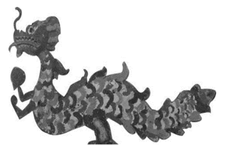
Figure 8: Dragon IV