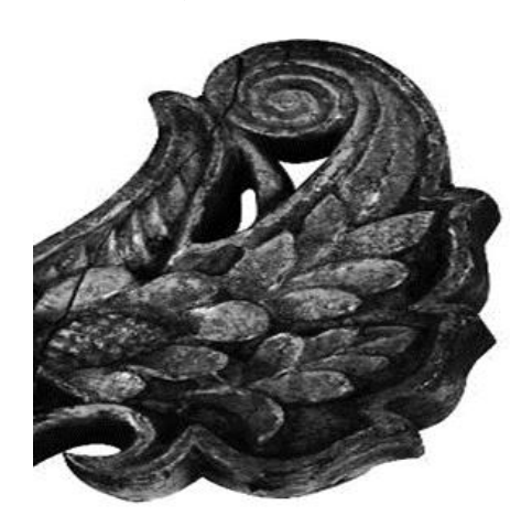
Figure 3: Bangau