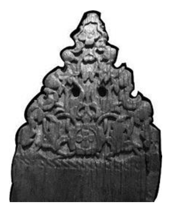
Figure 9: Caping I

Caping is a piece of wood that is shaped like an oval betel and carved full with creeping plants motifs. It is also described as the ficus tree (pohon beringin) or the bodhi tree, which is considered sacred to the Malay community. The caping is permanently installed on the boat and cannot be moved. Much like the ficus tree, the caping stands firm, strong and is unshakeable. The lush and tall ficus tree is a place of shelter for various types of birds and animals. In ancient Malay belief, the ficus tree is the home of guardians and supernatural creatures. During the previous generation's practice, the shaman will conduct a ceremony honouring the spirit of the boat with a spell. In the process, the areca nut, coconut blossom, and paan are placed on the caping (Mohamad, 1989). The fishermen community considers the caping part as the most important part of a boat as it serves as a guardian of the fishermen's safety.