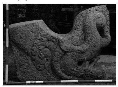
Figure 4: Makara

Symbolism in Traditional Malay Boat Crafting in the East Coast