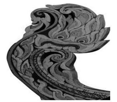
Figure 5: Dragon I

The dragon image is also evidently used on many components of the boat decoration on the East Coast. Images of the dragon are often found in the linggi part, with the shape of the bangau (along with the motifs on it, okok and the paintings on the body of the boat. The dragon is a creature that lives in the water, and in the Malay community, the dragon is a symbol of saviour and keeper of the earth. It also represents fertility, as the dragon keeps the balance of water and thrives in it. The dragon is also regarded as the guardian of the fishermen's safety while they are at sea. The use of this dragon image is often present in the bangau carving, where the dragon's carvings are combined with plants motifs.