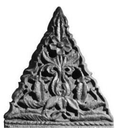
Figure 10: Caping II