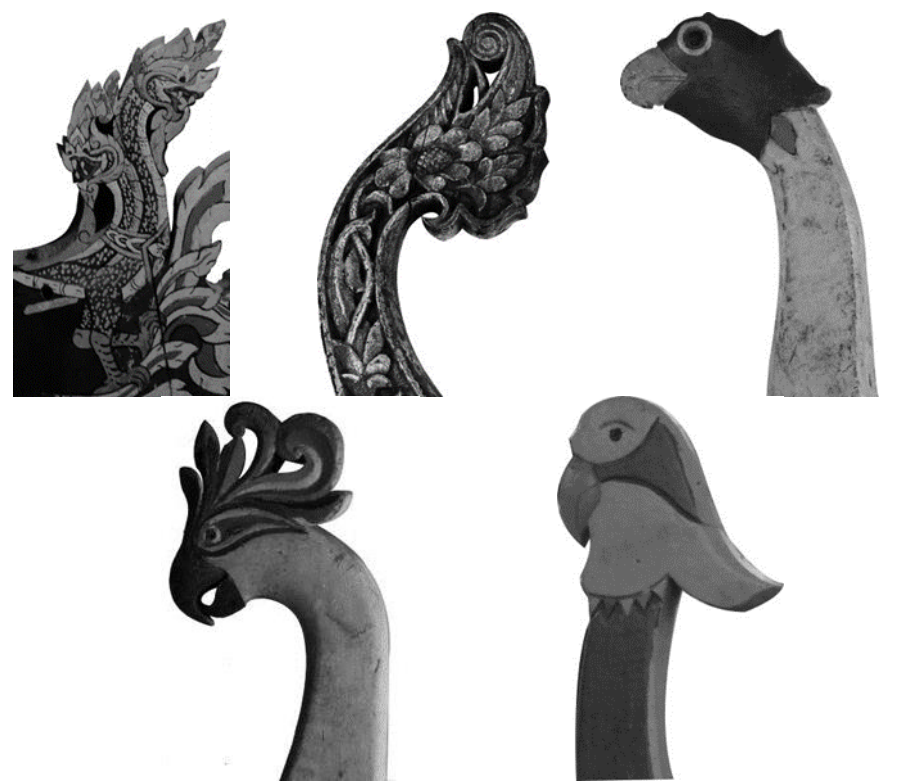
Figure 12: Some of the bird images of boat decoration

Zainon (1985) in the Malay community, birds represent spirit, strength, and pride. Birds are also a form of transportation, which are also associated with the symbol of sustenance. The image of the bangau is also associated with the characteristics of a stork that is capable of observing and catching fish. Bird motifs are widely found on the linggi , bangau , okok , koyang , sangga and boat body.