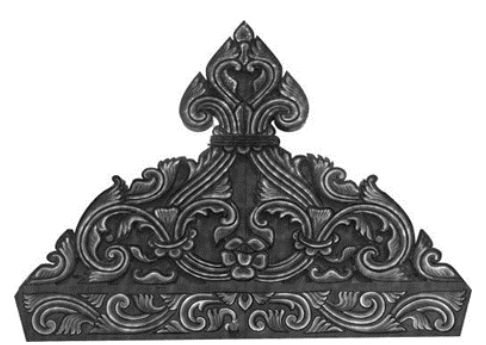
Figure 11: Caping III

Bird images are often used in Malay art, especially on the head of keris . In Hindu myths, birds are used by the God Vishnu as a mode of air transportation. Birds are also associated with animals that are loyal and strong, like the Petalawati Bird character in the Hikayat Ramayana story. According to Siti