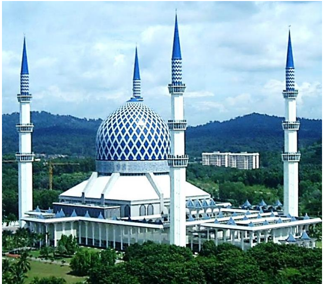
Figure 3 Blue Mosque Shah Alam, Selangor, Malaysia

more popularity, especially with the major state funded mosques. An outstanding example is the Blue Mosque or Shah Alam Mosque, the largest mosque in Malaysia that was completed in 1988. This mosque which is also known by the name of its founder as Sultan Salahuddin Abdul Aziz Mosque, has been reported by the Malaysian Ministry of Tourism in 2011 to be Malaysia's largest mosque and the second largest in Southeast Asia. First glance at the pictures of the mosque one could easily imagine that its location is somewhere in Iran or Turkey. The form of the dome as well as the glazed blue tiles that entirely cover it, and coloured windows seem Persian. While the overall plan with the four tall minarets shows Ottoman influence (Figure 3). From the outer appearance of the Blue Mosque, no Malay element is noticeable; although the inner skin of the dome is covered with wooden panels that reflect Malay traditional architecture.