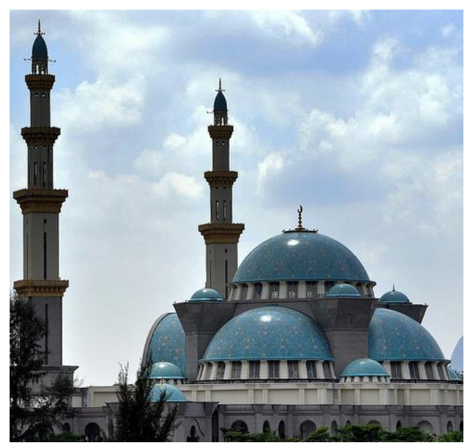
Figure 4 Masjid Wilayah, KL, Malaysia

Mahal of Agra (India), and Egyptian and Moroccan features, alongside native traditional elements (Figure 4).