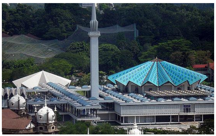
Figure 2 National Mosque or Masjid Negara, completed in 1965 is the larger structure with patterned roof on the right while the smaller building with similar roof structure on the left is the Hero's Mausoleum (Makam Pahlawan).