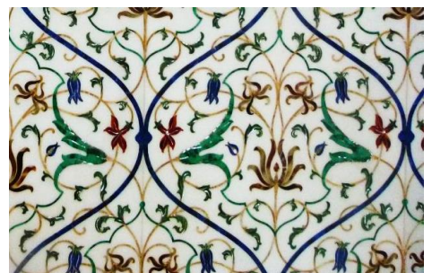
Figure 6 Parchinkari with Semi-Precious Stones and Mother of Pearls, Mihrab of Masjid Wilayah

ARCHES: Masjid Wilayah has five covered porchs, marked by horse-shoe arches in Moroccan style, surrounding its large courtyard. (Figure 8)