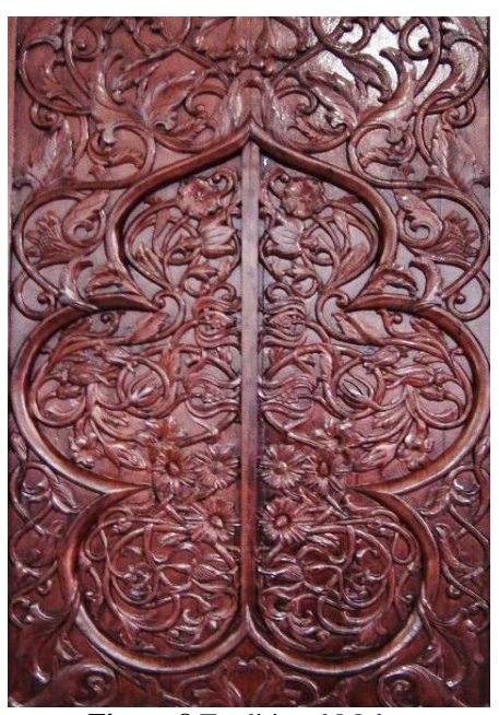
Figure 8 Traditional Malay Woodcarving with Floral Motifs Inspired by Local Plants, Door to the Main Prayer Hall, Masjid Wilayah