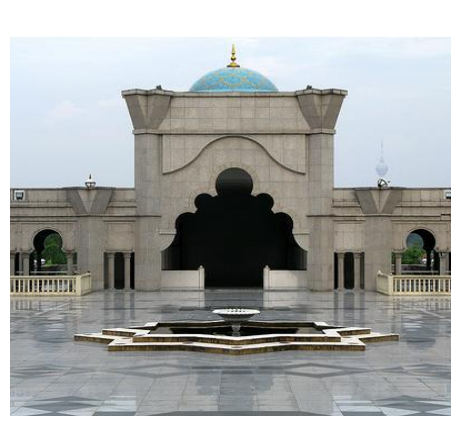
Figure 7 Moroccan Arches Surrounding Masjid Wilayah's Courtyard.