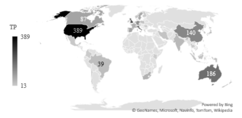
Figure 3. Geographical Distribution of Publication

Certain territories or zones show no more scientific articles than others within the research period. This study exposes the European countries that dominate urban planning and resilience research, with 10 European countries placing within the top 20 contributor countries list. Meanwhile, countries from the continent of Africa contributed the least, as seen in the geographic distribution of publications in Figure 3.