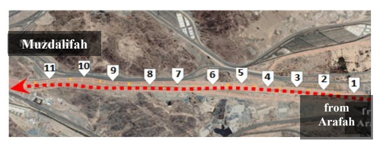
Figure 4.1: The location and key plan for Nafra, from Arafah to Muzdalifah

walking threshold to the pedestrian facilities provided for selected route of this study.