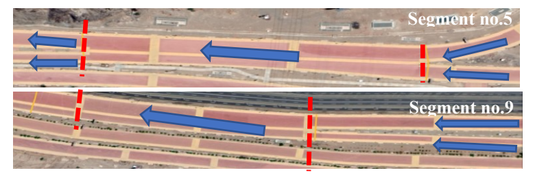
Figure 4.2: The dotted red line illustrate the merging of two sidewalk for segment no. 5 and no.9

larger pedestrian lane of 52m width, for instance segment number 5, 9, 10 and 11. Figure 4.2 illustrates the merging of pedestrian segments of number 5 and 9.