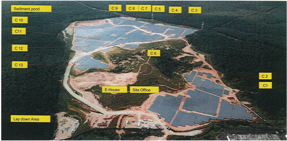
Figure 2: The Layout of YPJ Solar Farm Power Plant